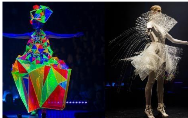
World of WearableArt™