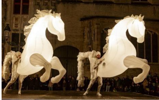
FierS à Cheval by Compagnie des Quidams

11 To amp up the reverie, Spanish percussion troupe Deabru Beltzak will team up with local percussion group, MOTUS, to present Su á Feu – a rousing performance of dance, percussion and fire. Dressed as futuristic invaders, the performance will take to the festival grounds and invite the public to liven up the streets for a night of fun and laughter.