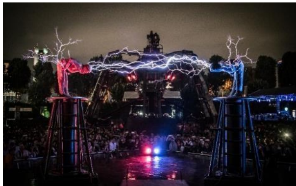
The Duel by Lords of Lightning

12 Performing in Singapore for the first time, UK troupe Lords of Lightning will also stun audiences with a show of electrical wizardry. The performance features a duel that harnesses nearly four million volts of electricity and sends lightning bolts hurtling up into the air – a feat achieved through an amalgamation of physics and art.