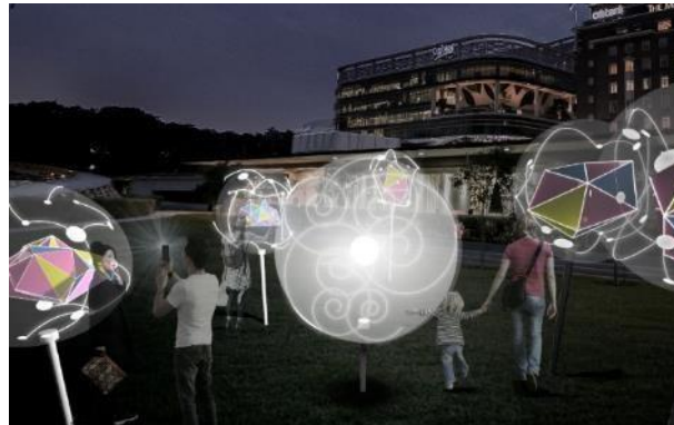
Orbit by LiteWerkz x 3M

15 Among the selected open call works is the team behind past festival favourites #showerthoughts (2016) and Tessellations of Time (2017) – LiteWerkz, which comprises of a group of students from the Singapore University of Technology and Design (SUTD). They will present a solar-system inspired installation titled Orbit for SNF 2018 , promising a one-of-a-kind experience and #selfie opportunity that cannot be replicated as visitors trigger a unique sequence of light and reflection as they interact with the installation.